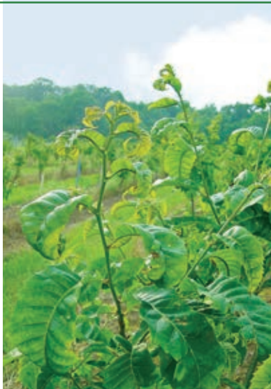
Chestnut saplings show leaf curl caused by aphids.

In other cases, good sanitation alone should do the trick. That means harvesting directly off the tree and collecting fallen nuts daily, before larvae escape into the ground. Depending on your goals, simply burn the nuts, or store them in a thick, plastic bucket to capture emerging larvae. Destroy the larvae and use the good nuts that don't have holes in them. If you plan to eat the nuts, dunk freshly harvested chestnuts in 120°F water for 20 minutes. The heat kills eggs and larvae inside the nuts—usually when they're still too small to notice. Bon appétit!