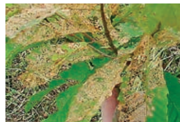
Lacy leaves are typical damage caused by Japanese beetles.