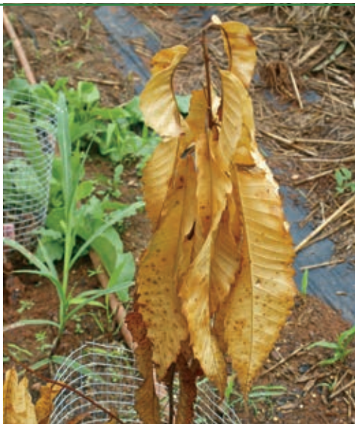
Phytophthora attacks the root system, denying the tree nutrients and water.

millions of microorganisms, some of which may attack or slow the spread of Cryphonectria parasitica . Gather soil from around the tree, add water until it makes a thick paste and pack it around the canker, holding it in place with 4-inch-wide shrink wrap purchased from a building supply store. Extend the mudpack about a foot above and below the canker so the canker cannot expand beyond the treatment area. You must treat all the cankers on a tree and inspect the tree monthly, treating new cankers and replacing the mudpacks on old cankers annually. As the tree grows larger it becomes more difficult to reach and treat all the cankers, but this method can extend the life of the tree.