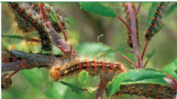
Gypsy moth caterpillars are voracious and can defoliate entire orchards.

Many small, soft-bodied insects drink plant sap using flexible, straw-like mouth parts. They can deplete a tree's resources and inject toxic saliva that causes leaves and shoots to become distorted and yellow. Aphids, whiteflies, phylloxerans, and leafhoppers can all damage chestnuts, although they're rarely bad enough to warrant treatment. Aphids are small, soft, grenade-shaped insects with or without wings; whiteflies are minute, white bugs that often flutter off leaves when disturbed. Both groups make sweet, sticky excrement that can be messy and promote mold growth, but their natural enemies usually keep them in check. Phylloxerans can cause more severe yellowing and crinkling of leaves; look for yellow or orange slow-moving, soft-bodied insects clustered along leaf veins. Similar damage can also result from potato leafhoppers—bright green, wedge-shaped insects that scamper quickly across the leaves. If any of these groups reach damaging levels, check with your extension agent for a positive ID and treatment recommendations.